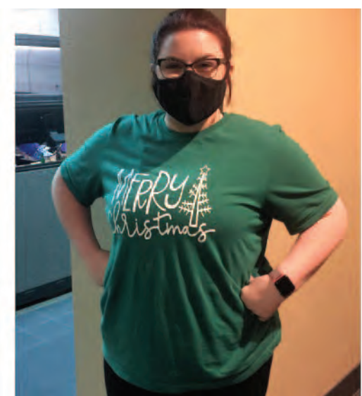
...a selection of Raceway Division ugly Christmas sweaters.

December 23rd was designated as ugly Christmas sweater day at the Raceway Division. The associates certainly did not disappoint with their ugly sweater selections.