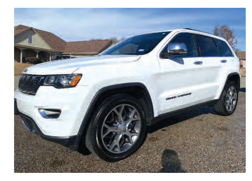
As their Christmas gift, each associate was offered the choice of having their vehicle detailed by Power House Detailing or a gift card for Hello Fresh meal delivery.

East Texas CASA (Court Appointed Special Advocate) benefited from some of that generosity. The Raceway Division purchased toys for two siblings to make their Christmas a little merrier.