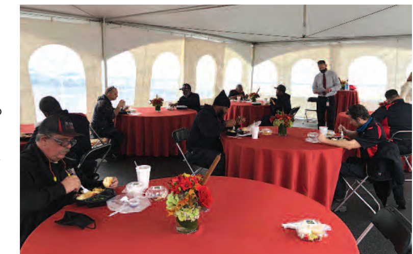
The Raceway Thanksgiving dining room

In addition, each associate received a smoked turkey from Bear Creek Smokehouse in Marshall, Texas. That company has a 77 year tradition of providing smoked meats to the surrounding communities.