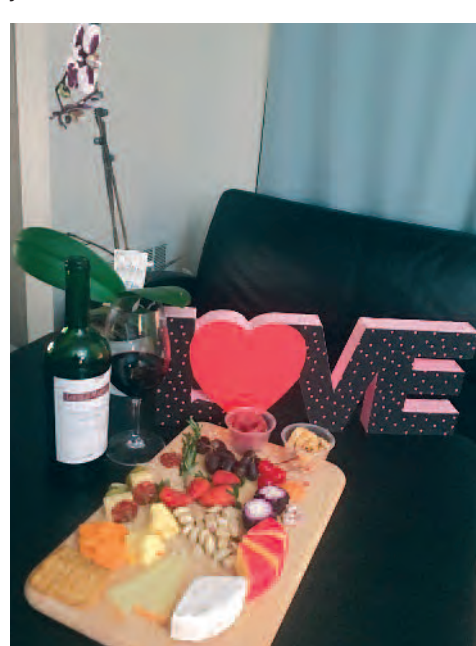
Contents of the EZPZ Gathering box accompanied by wine

what their experience would be and why, provide some background and just have fun with it.