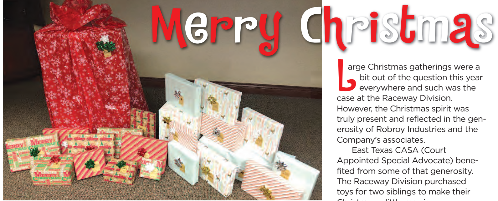
Wouldn't you want to wake-up to all those gifts under your tree?

In place of the Kids' Christmas Party, HR Associates packed goodie bags and distributed them to Raceway Associates for their children