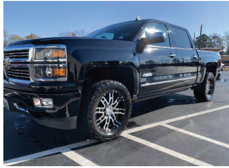
Some of the associates who chose to have their vehicle detailed proudly showed off the finished product.