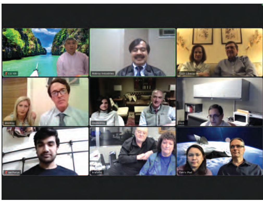
The whole crew - Headquarters Staff

An invitation was sent to each associate inviting them and their spouse to virtually attend the meeting, which would begin with a wine toast. Then, participants were asked to be ready to share an imaginably, incredible opportunity that they might be granted. It could be anything, for example – a flight to the moon. Associates were to share